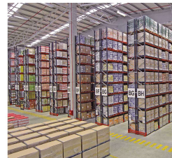
Descriptive photo of the CONVENTIONAL PALLET RACKING system.